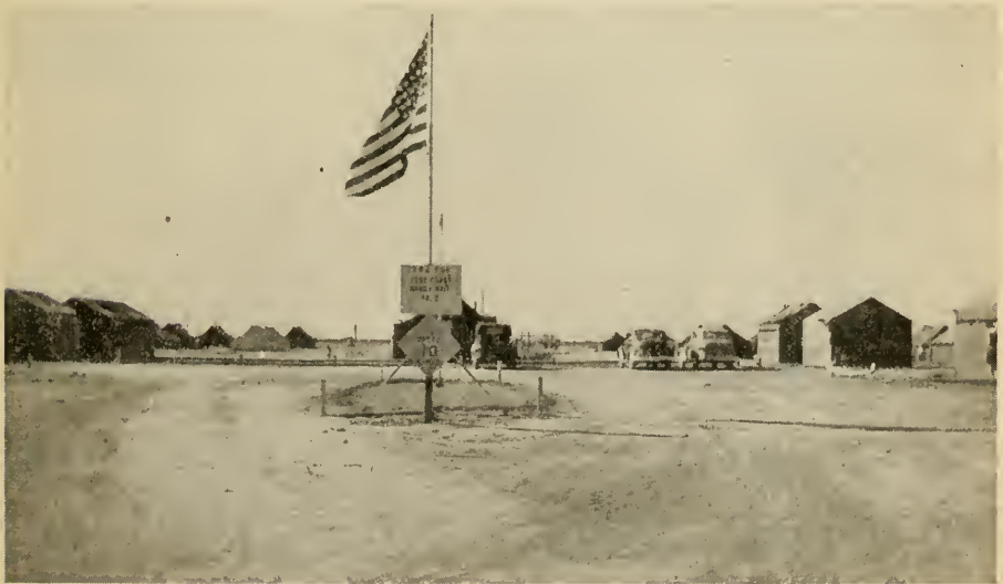
At Eloy Government Camp in Arizona, where a deaconess is serving

Today that boy is the owner of one of the large optical companies in the heart of Manhattan. His generosity in helping others, even as he was helped, still prevails through his kindly ministry in the business world. His personal testimony to the one who met him recently is this: "All that I am and have I owe to the deaconesses in Boston. Now I want to help them."